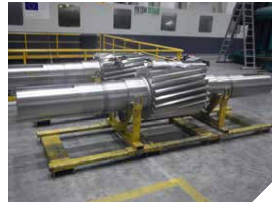
A new and optimized pinion certified for installation