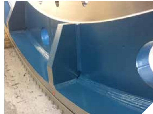
Replacing a previously cast gear with a new welded design